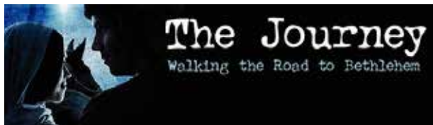
The Journey: Walking the Road to Bethlehem